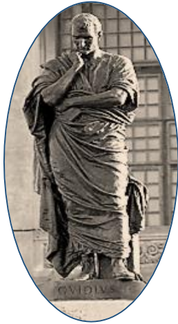
Publius Ovidius Naso Constanța