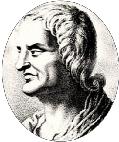
Decimus Iunius Juvenalis