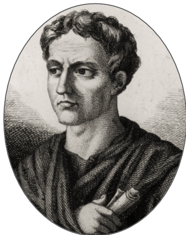
Gaius Petronius Arbiter