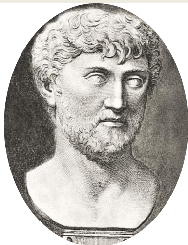
Titus Lucretius Carus