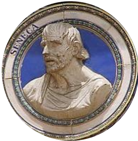
Seneca the Rhetorician