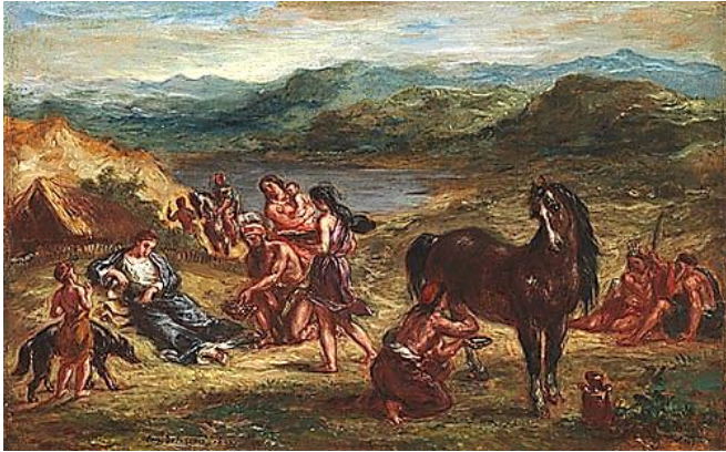
Eugène Delacroix: Ovid among the Scythians